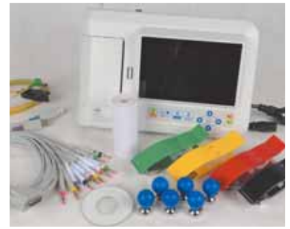
ECG AND ACCESSORIES