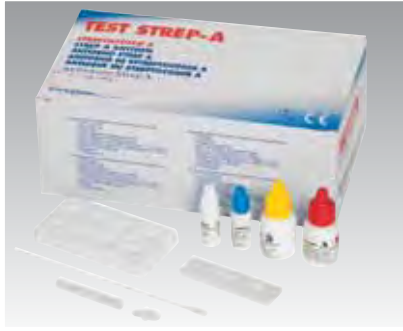
STREP-A RAPID TEST