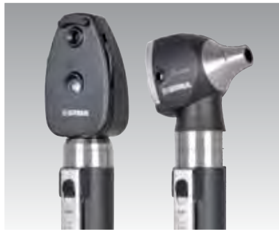
SIGMA F.O. OTO-OPHTHALMOSCOPIES